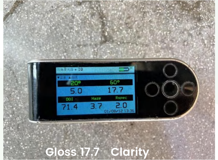
Gloss 17.7 Clarity