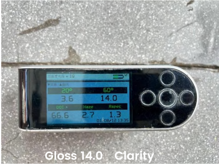
Gloss 14.0 Clarity